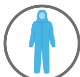
Coverall with hood