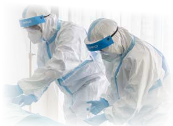
BPL PPE Kit