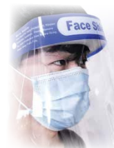
BPL Face shield